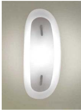
Satin White glass