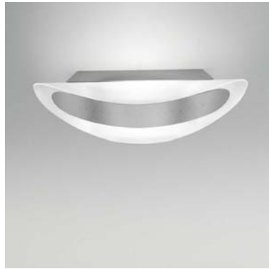
Polished Chrome metal front screen