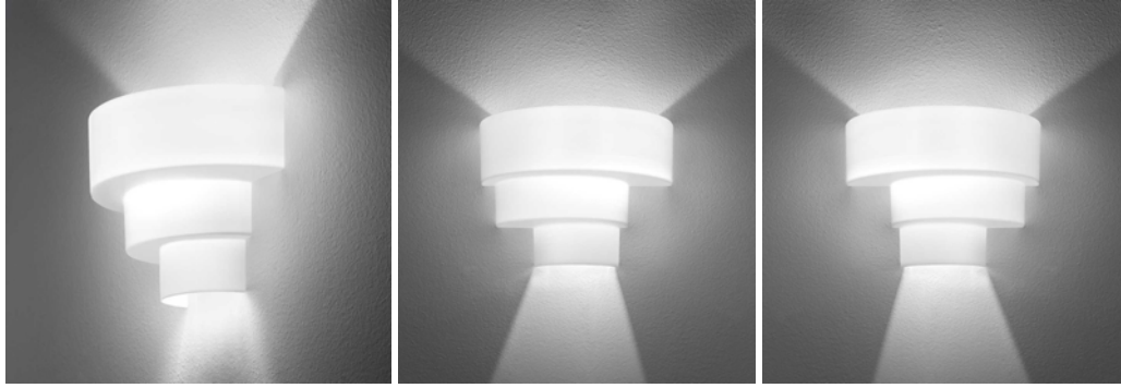
LOOP P SX (Left)