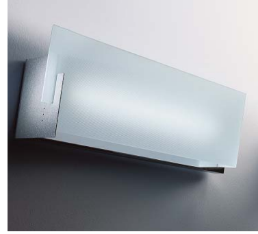
Manhattan P53 (Ribbed Pale Green)