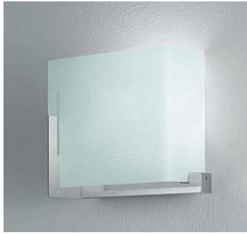
Manhattan P24 (Ribbed Pale Green)