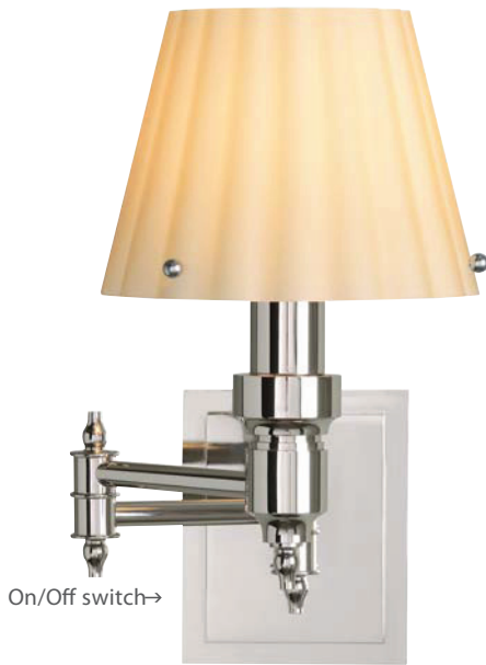
LATTE GLASS Shown approximately 25% actual size.