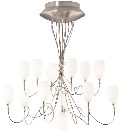
FROST Shown approximately 10% actual size.