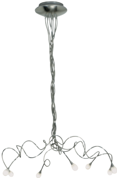
HARMONY Shown approximately 10% actual size.